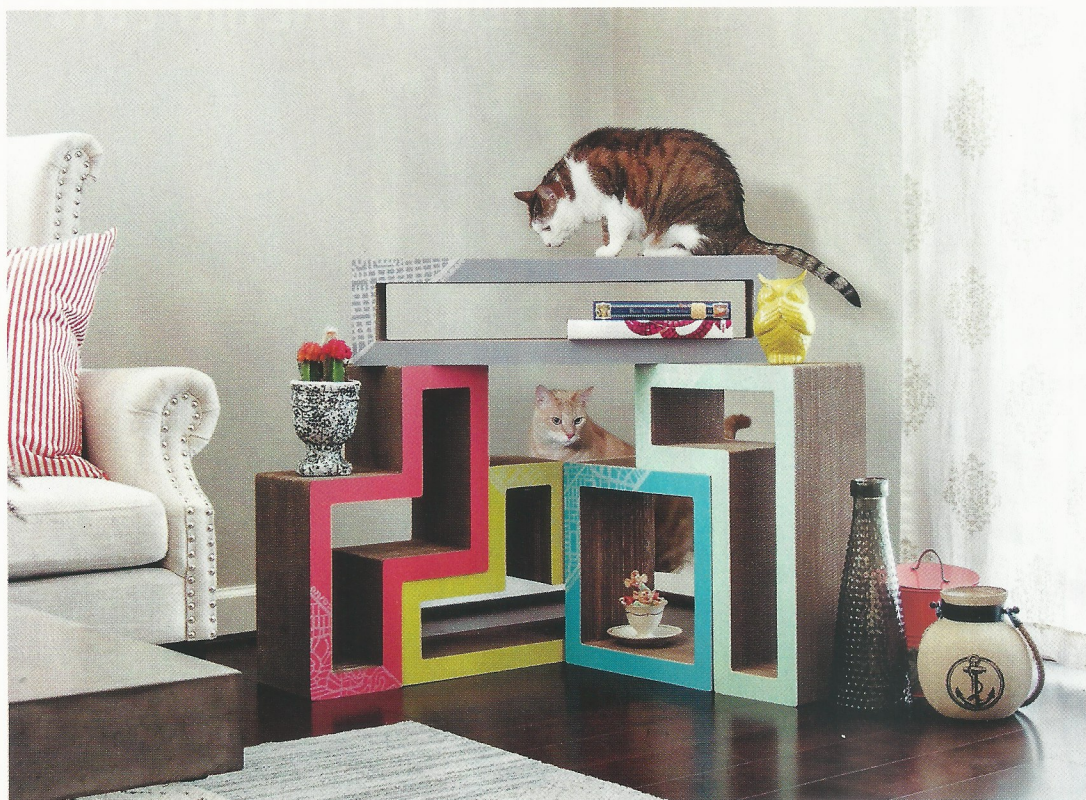
LEFT: Cat furniture has come a long way since its cardboard-and-carpet heyday. With the Katris Modular Cat Tree, you can assemble a scalable, scratchable outpost for your cat that doubles as an eye-catching bookshelf or display case. $200 (katriscat.com)

To accommodate your companions' superior hearing abilities, soften hard surfaces with rugs, acoustic panels and soft textiles to reduce loud reverberations that can disturb animals. Also, be certain to check your home and garden for potentially hazardous ingestibles, such as oleander, cyclamen or lilies, and offer alternatives. Indoors, catnip or chew toys serve as healthy substitutes for houseplants and furniture legs. Finally, treat your cuddly critters to their own sumptuous furnishings and choose low-maintenance upholstery that can tolerate use by furry friends.